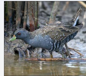
Australian Spotted Crake

This bird list was compiled from Queensland Parks and Wildlife "Wildlife Online" data, in collaboration with sightings recorded by members of the Townsville Region Bird Observers Club. Other birds may be seen that are not listed in this brochure.